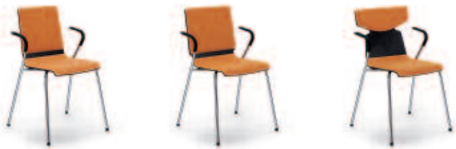
4-leg model with armrests integrated in the steel frame, straight-sided-, tailored- or T-shape one-piece shell, with seat and backrest cushion on request