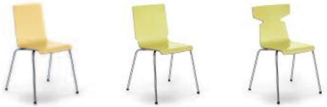
4-leg model with steel frame, straight-sided-, tailored- or T-shape one-piece shell (picture: with laminate)